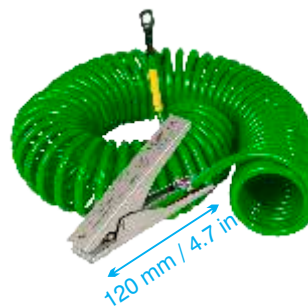
X45 Stainless Steel Static Earthing Clamp with 3m (10ft) (extended) retractable cable.