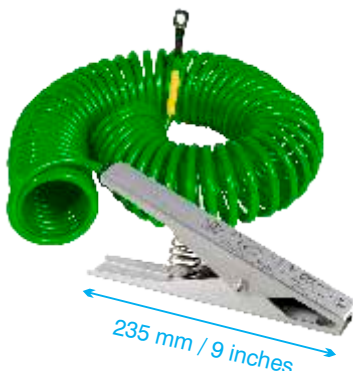
X90 Stainless Steel Static Earthing Clamp with 5m (16ft) (extended) retractable cable.

The blue cables are generally supplied with a pair of conductors to provide an earthing and monitoring loop, but are also available with a single conductor for monitoring an item that is already earthed.