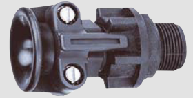
Trumpet shaped cable gland