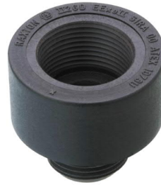
Type AJ Round

Nylon adaptors and reducers are Exe only and designed with a circular head. Parallel threaded Exe adaptors and reducers are supplied with an undercut and EPDM O-ring to maintain the IP integrity of the installation. Raxton adaptors and reducers are marked with the applicable approval number and size.