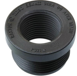
Type BJ Round