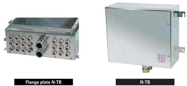
Flange plate N-TB