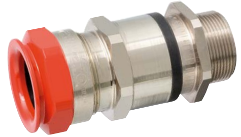
ADE 6F NPT