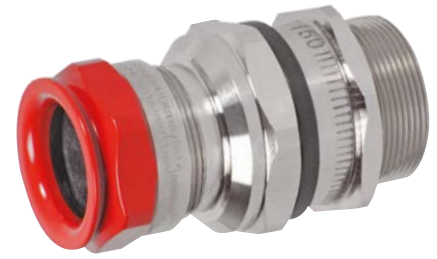
ADE 1F2 NPT