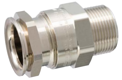
ADE 1F2 NPT