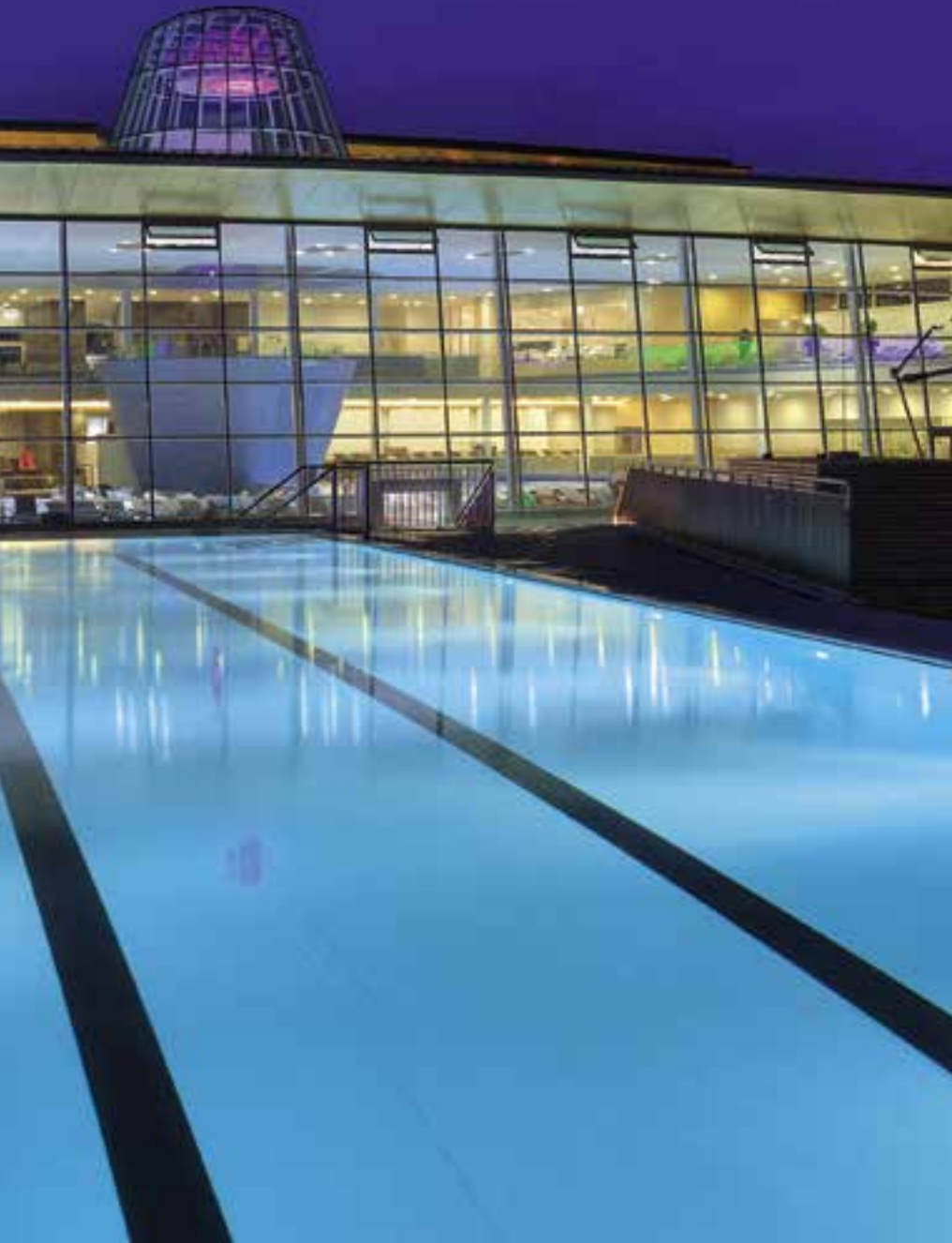
< Project Tauern Spa Kaprun, Austria

Power supplies Technical details see from page 234.