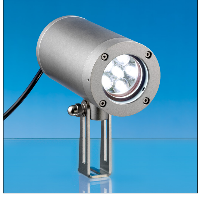
Lumistar luminaire ASL 55-LED-Ex