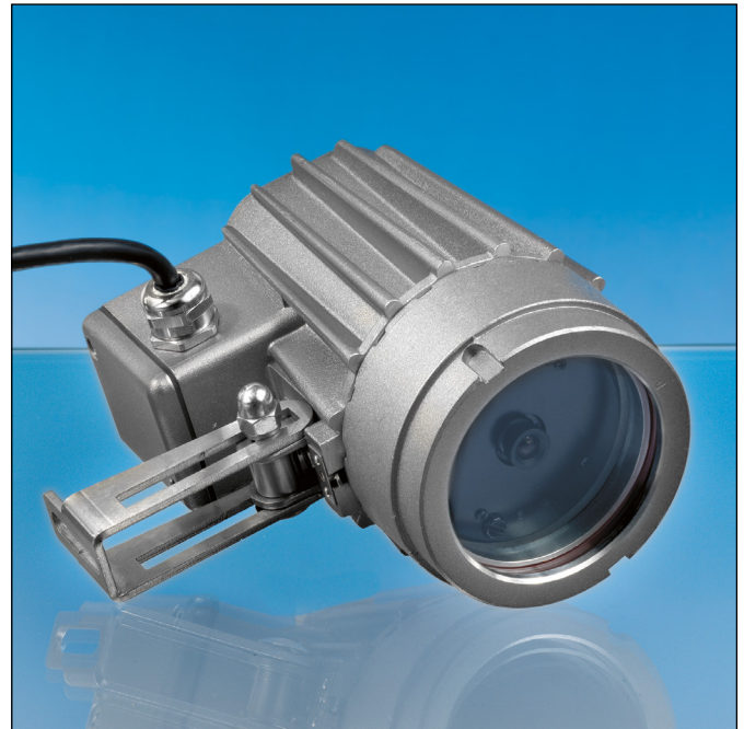
VISULEX Ex-Camera K06A-Ex with fixed lens