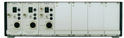
6-camera rack equipped with three camera modules