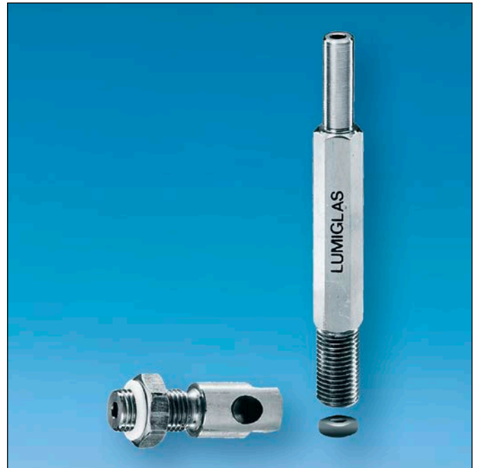
Lumiglas spray device