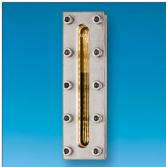
Complete assembly of a Lumiglas sight glass fitting rectangular