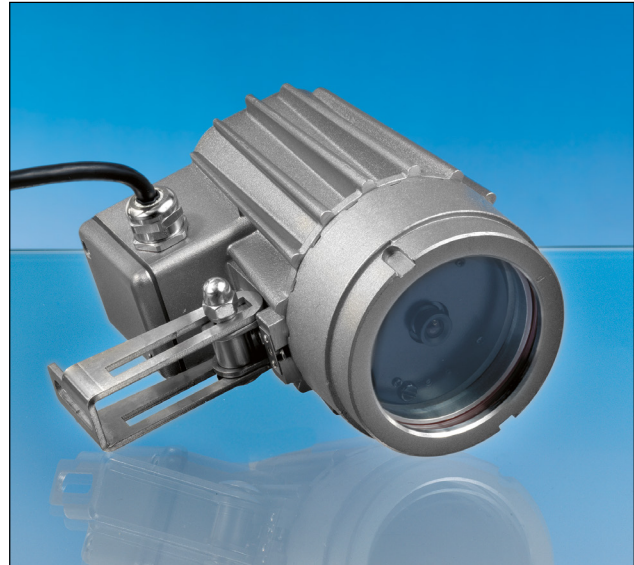
VISULEX Ex-Camera K06A-Ex with fixed lens