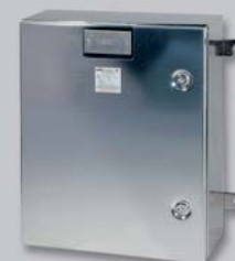
Terminal box in stainless steel version