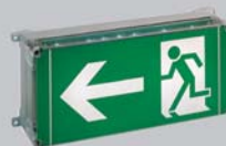
Guiding the way: Emergency Exit luminaire