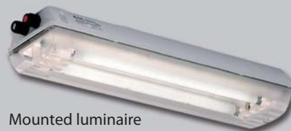
Mounted luminaire for more light