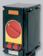
Safety switch with EMERGENCY STOP